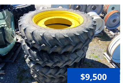
2013 Goodyear 480/80R50 tires for a John Deere 4940 self-propelled wheels and tires (40% remains). (PA) U1585A