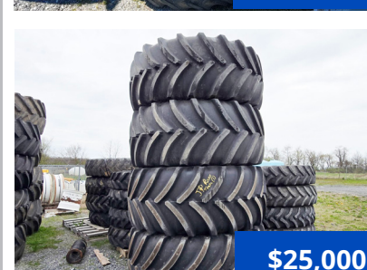
Set of 4 Goodyear 900/50R46 floater tires (50% remains). Three sets available. (PA) U1591A, U1593A, U1594A