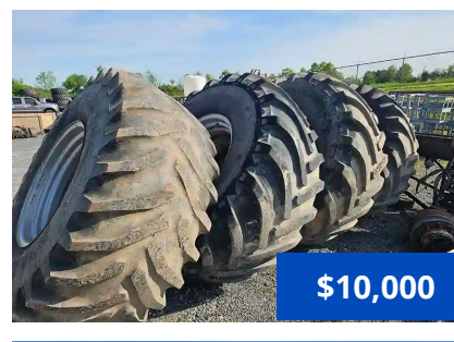
Set of 4 Goodyear 800/65R32 floater tires (50% remains). (PA) U1590A