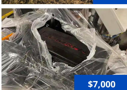
2019 Cummins QSL9 Diesel Engine, Used Cummins engine, 6 cylinder, 9L, 350 hp at 2100 rpm. (PA) U1558